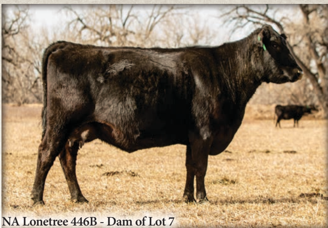
NA Lonetree 446B - Dam of Lot 7