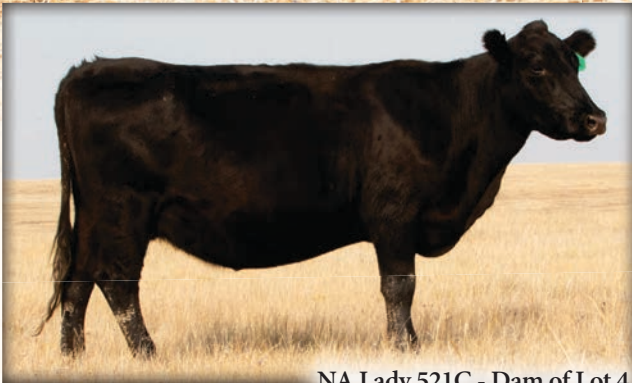
NA Lady 521C - Dam of Lot 4