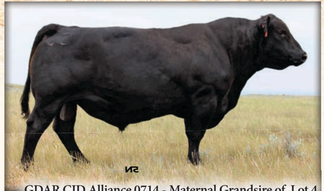
GDAR CJD Alliance 0714 - Maternal Grand sire of Lot 4