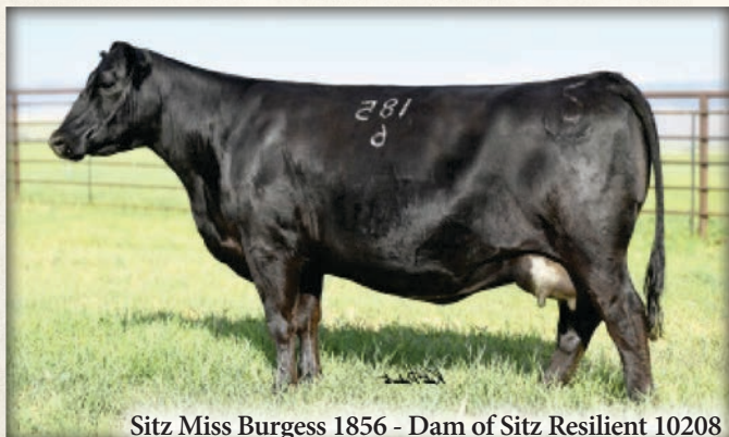
Sitz Miss Burgess 1856 - Dam of Sitz Resilient 10208