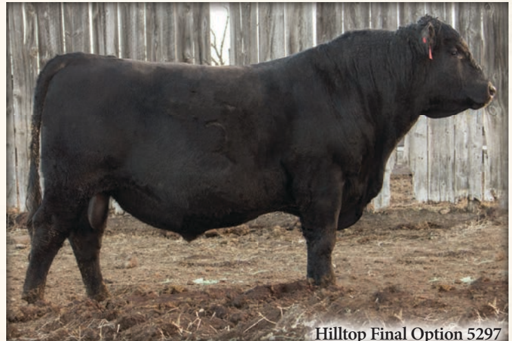
Hilltop Final Option 5297