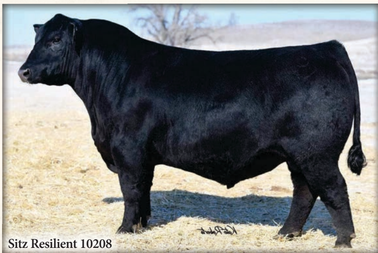
Sitz Resilient 10208