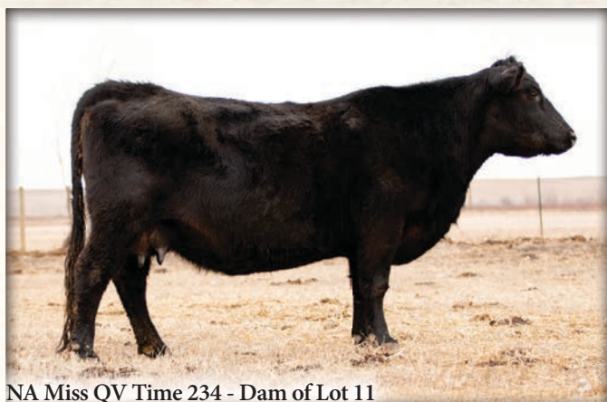
NA Miss QV Time 234 - Dam of Lot 11