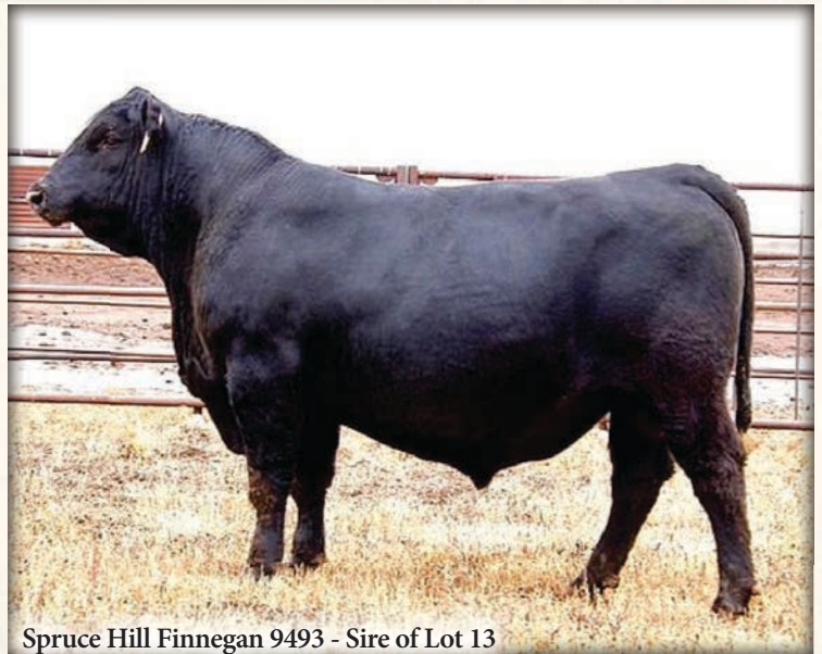
Spruce Hill Finnegan 9493 - Sire of Lot 13

“Quality is doing it right when no one is looking” - Henry Ford